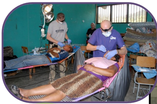
MHL dentists & doctors working in Montaña de la Flor