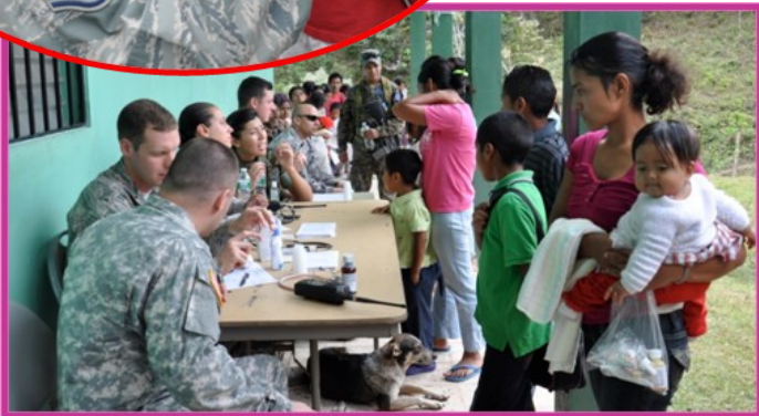
Tolupan in triage line