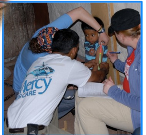
Using MUAC bracelet (above) to measure malnutrition