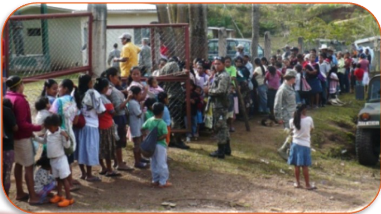
Tolupan standing in line for medical care

80% of people in rural Honduras use surface water sources, causing many health problems