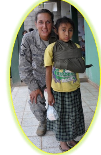
The Tolupan are the oldest indigenous group in Honduras