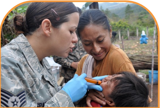
Administering deworming medication