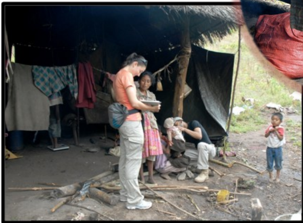
Grass huts of the Tolupan

80% of people in rural Honduras use surface water sources, causing many health problems