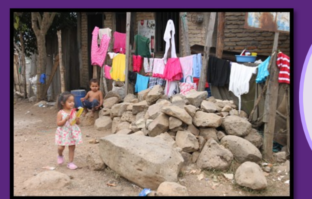
Thanks to all who worked or donated to TFJO

69% of Hondurans live in poverty. 50% in extreme poverty.