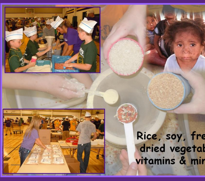
Chronic malnutrition can reach 48.5% in Honduras' rural areas, with a stunting rate of 34%. After age 2, stunting is permanent.