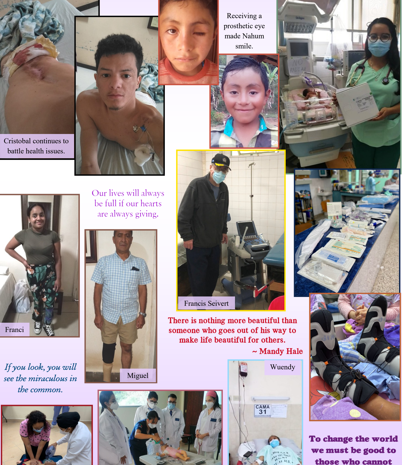
repay us. ~ Pope Francis