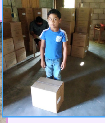
3 million children will die each year from malnutrition -

Honduras, like much of the world, seems to be facing an unprecedented crisis in hunger and malnutrition. As prices skyrocket and food becomes scarcer, the children of the poorest nations on earth, like Honduras, will suffer. Your continued support for Then Feed Just One means that together we can have a major impact on the lives of thousands.