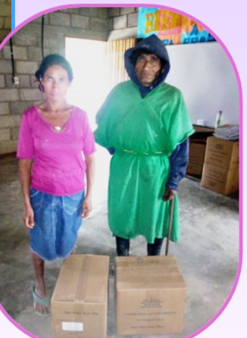
100% of them are preventable. ~ Navyn Salem, Edesia founder