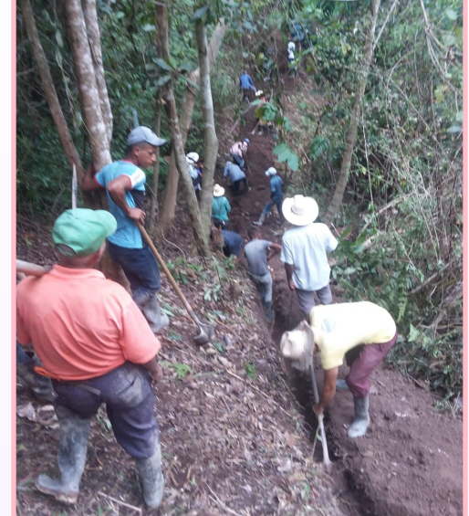
Water projects were funded for Mariposa and Matapalo.

In the past hour, 60 children died from a water-related disease.