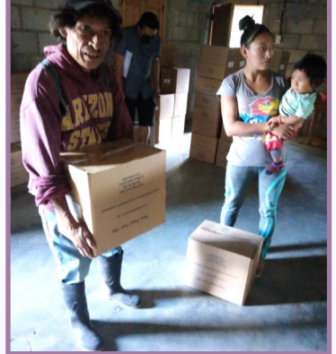
In children under 5, stunting levels are at 23%. In some areas of the country, it is closer to 40%.